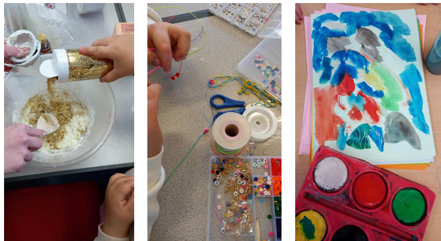
Children's brilliant creations at the arts and craft sessions on the Smithies Lane Travellers Site this month.

March will be a busy month for involved tenant meetings at Gateway Plaza. We are holding six meetings in March. If you would like more information on meetings you can attend, please contact us by any method opposite.